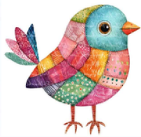
Quida Davis - Orange Stars & Stack-n-Whack