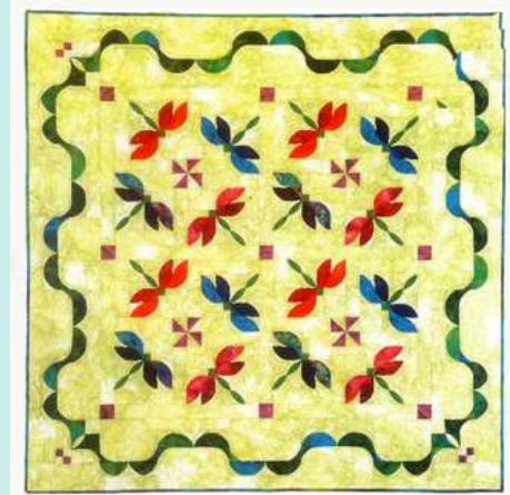
Dance of the Dragonflies Saturday - Sept. 12

Registration for classes begin at our June 1 st meeting. Classes will be held at the Brandon Library. Fabric & supply list will be provided in the near future.