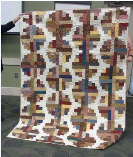
Susie Guyton - Log cabin circles and Love Notes