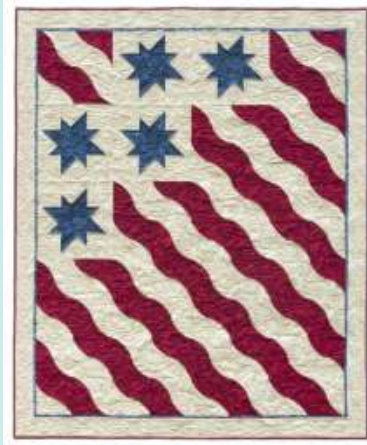
Waves of Glory Friday - Sept. 11