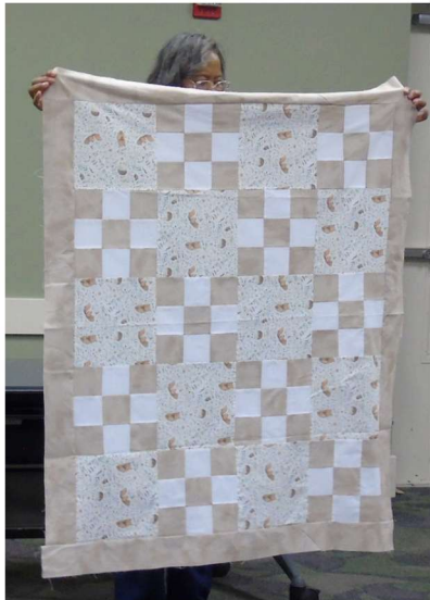
Diana Carey-Smith - Beige 9-patch