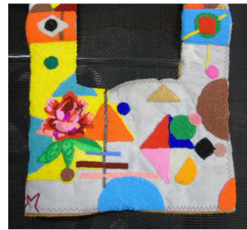
Sarah Gayden Hammond - beaded collar - close up of front and and back