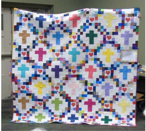
Wanda Deaver - Hearts and Crosses