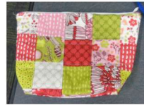
Shelia Kolle - Cute bags Stars & Stripes quilt