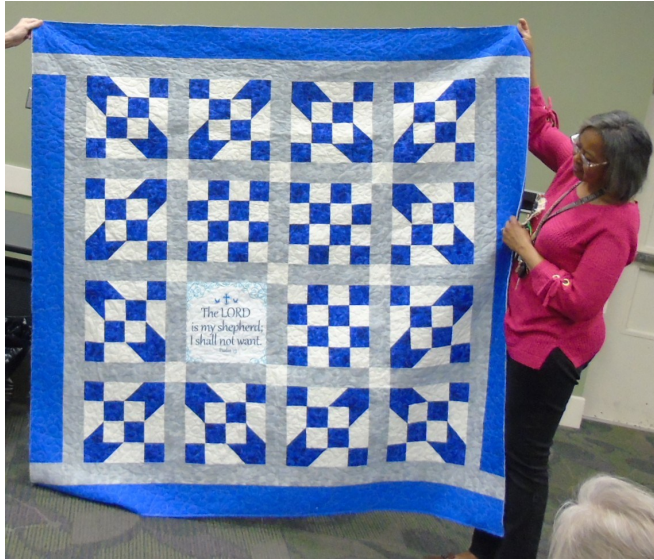
Diana Carey-Smith Blue square and three cheater quilts, great for practicing quilting on her long-arm as well as great looking quilts.