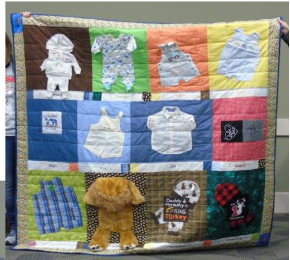
Quilt made from baby clothes.