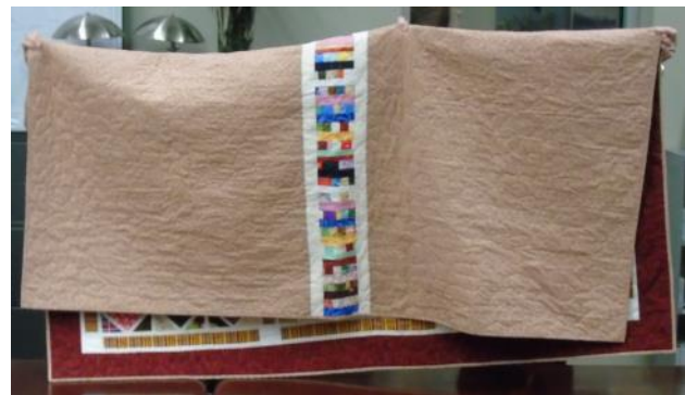
Lucy Large—COVID quilt, front and back