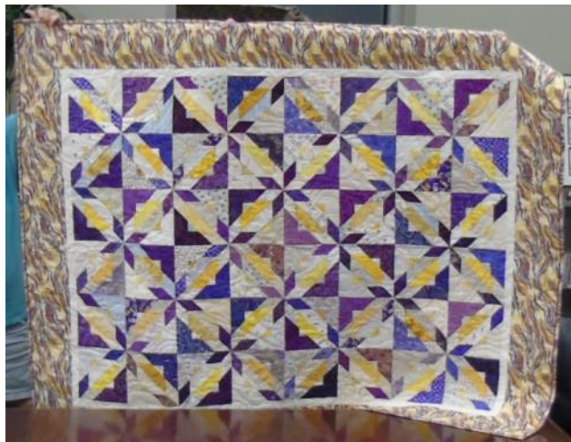
Pam Avara—Quilted jacket (sweatshirt) and Athena in LSU colors