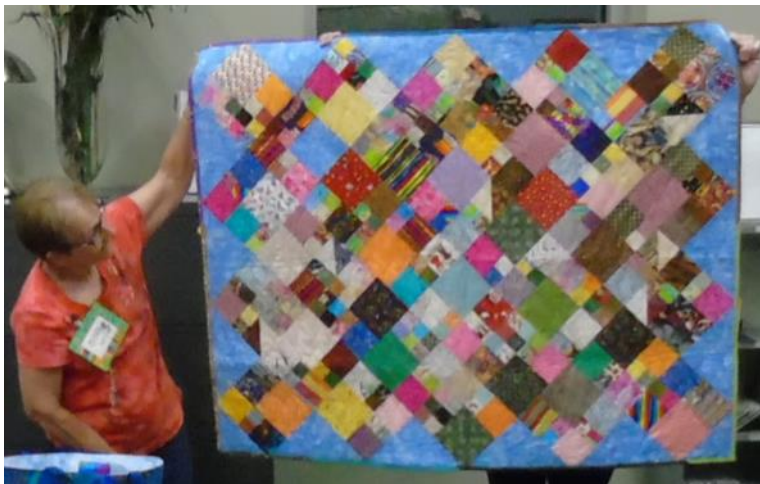
Polly Duggan - Crazy Triangles (Community quilt) Polly also showed a bag made from Kaffe fabric, unfortunately the photo was blurry.