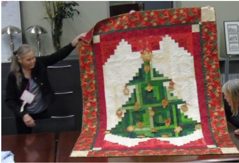
Cindy Barnett - Oh Christmas Tree (each ornament is a Machine embroidery Creation with tear away Foundation.