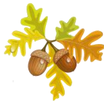
Pam Kirby - Seeing Triangles