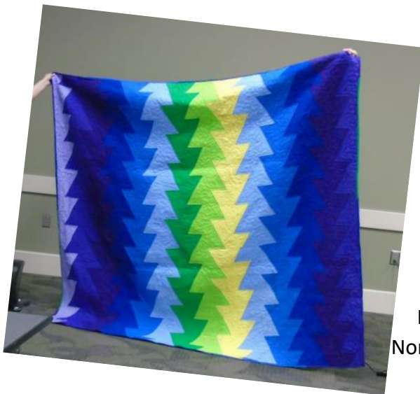
Karin Brown - Northern Lights (UFO)