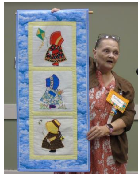
Laura Key—Sunbonnet wall hanging