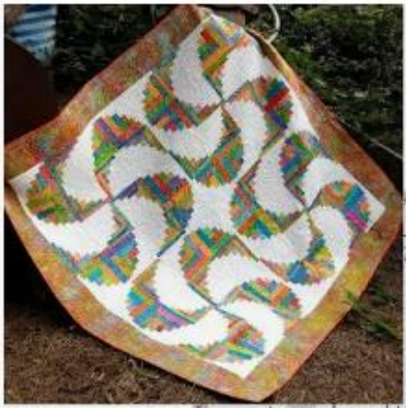
Rainbow Swirls pattern via Cut Loose Press

Patricia Welsch presented the Creative Grids Curvy Log Cabin ruler. She has both the 6' and 8" rulers. One convenience of Creative Grids rulers is the scan code on the ruler, when scanned it will open a YouTube tutorial to view without having to search for it. Also the size of strips required for the block are noted on the ruler for both the wide and narrow strips. The use of the two sizes of strips form the circle log cabin block. Trimming with the ruler on each go round (adding of two narrow and two wide strips) makes for a straight, consistent block before adding the next round of strips. Patricia had a quarter of the Rainbow Swirls quilt complete that she showed. She is considering making a wall hanging with it.