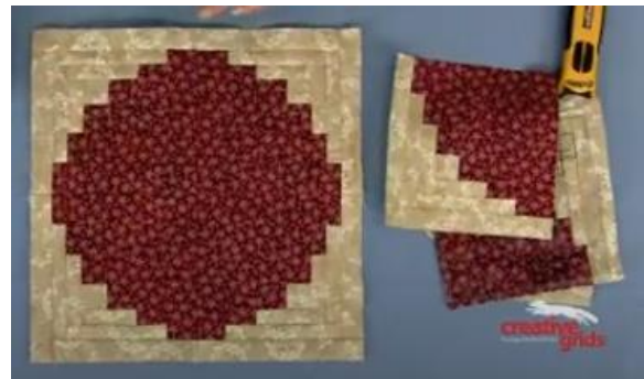
Four curvy log cabin blocks joined together to form a circle.