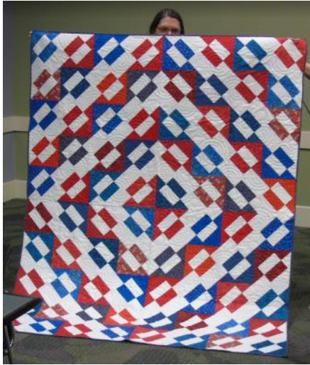
Pam Avara - Kimberly And Crystal (UFOs)