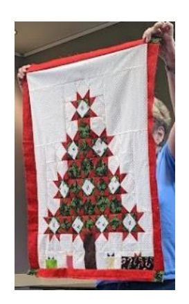
Lucy Large -Christmas Tree