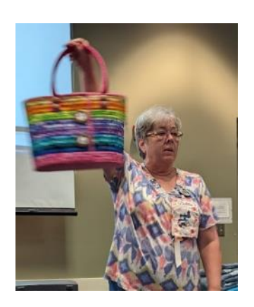
Debbie Wilson -Cute tote bag