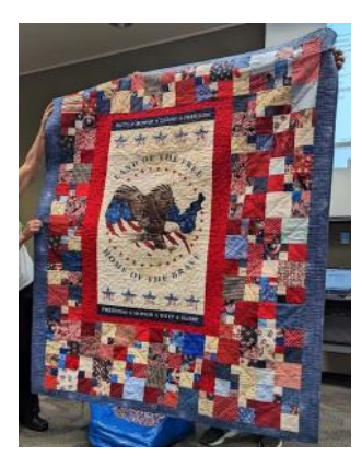
Polly Duggan— Patriotic quilt from panel