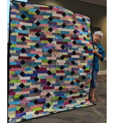
Darlene Browning -Jelly Roll And Large Block quilts