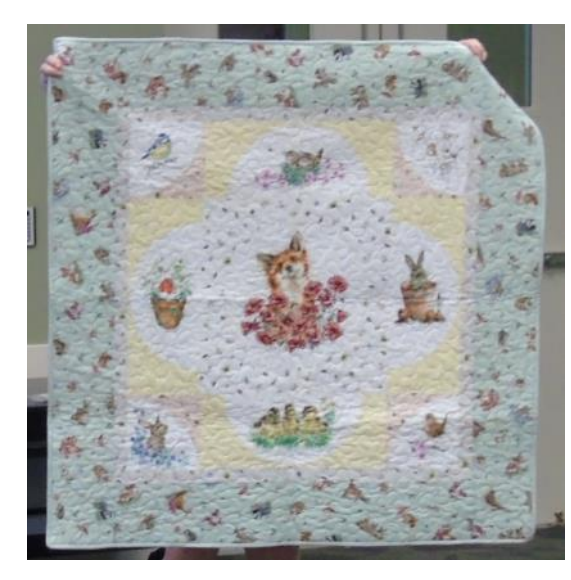
Kathleen Greer -Woodland Creatures