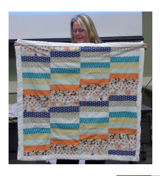
Pam Beard -Lap quilt and Strip quilt