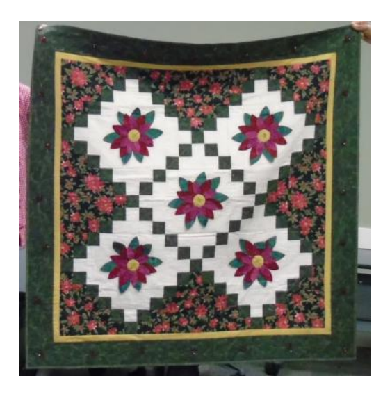
Pam Avara -WonderArc Poinsettias and Crazy Eights