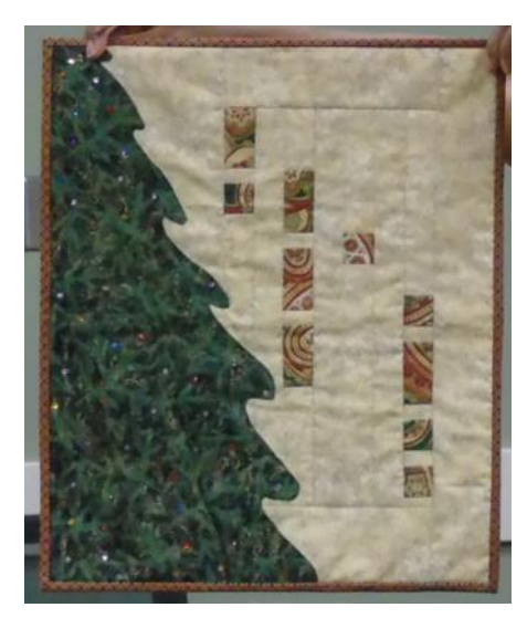
Polly Duggan—NOEL (in Morse code)