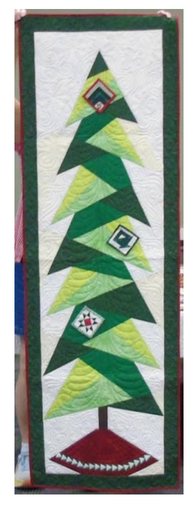
Sarah Ketchum—Christmas tree wall hanging and table topper