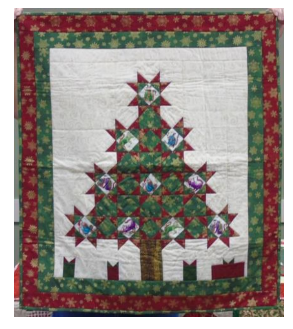
Linda Strickland—Cat's Christmas tree Wall hanging