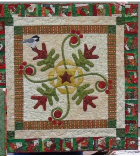
Polly Duggan -Christmas Chick-a-dee and Christmas string quilt wall hangings