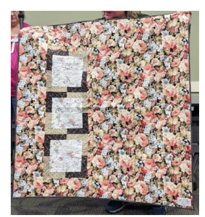
Pam Beard—Sweet As Honey (front and back)