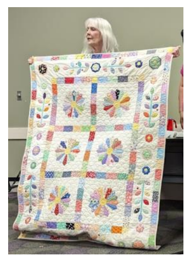
Jo Powell -Dresden Plan & Applique