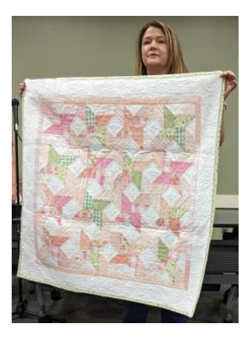
Polly Duggan—Charm squares in blue; Missy Lee—Totally Tulips and Ellen Meeler—Sweet Trellis