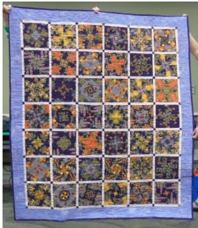
Ann McDonald - Charm bag, Yellow Brick Road and Stack & Whack