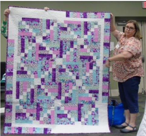
Sticks and Stones - two different color ways