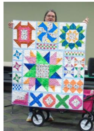
2021 Starlight Quilters BOM