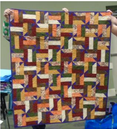
Fall Twist quilt