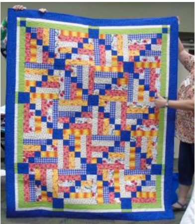
Another Sticks and Stones with solid borders