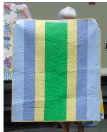
Delene Browning - Mother Goose panel and charm square quilts (cute quilt backs, too)