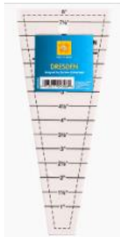
Darlene Zimmerman EZ Dresden Plate tool