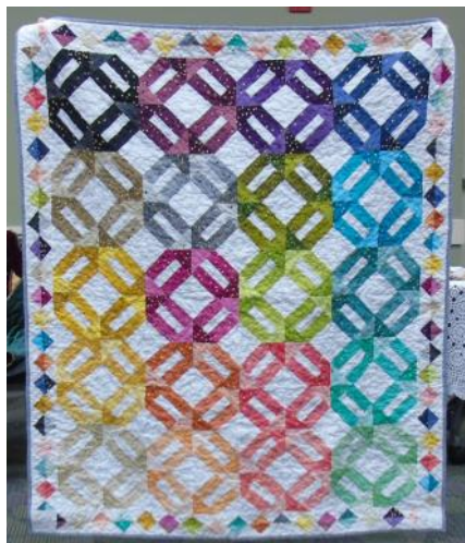
Debbie Wilson - Ombre' Weave and Yellow Brick Road pattern in blue