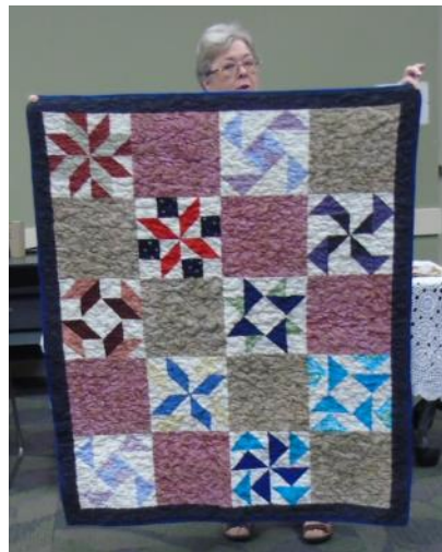
Debbie Wilson - sample blocks quilt