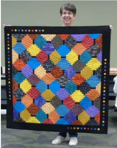
Amy Schwalm - Modern, colorful Courthouse steps