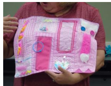
Finished Fidget quilt about the size of a fat quarter.