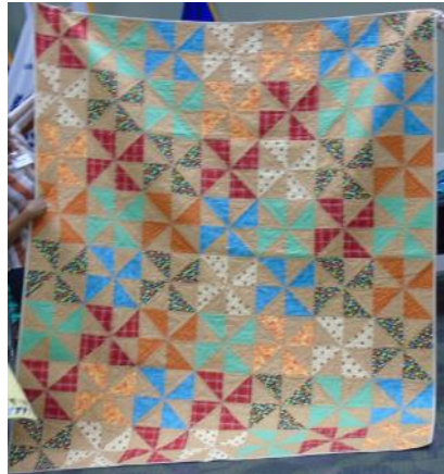
Dianne McLendon, Pin wheels