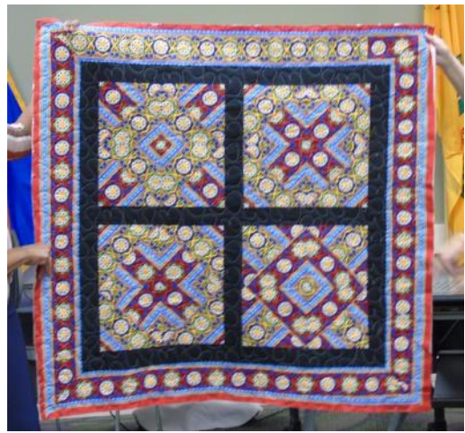
Judy Robbins, Red, White & Blue quilt, Christmas Tree table runner and One Fabric quilt from the "Wonderful 1 Fabric Quilts" book.