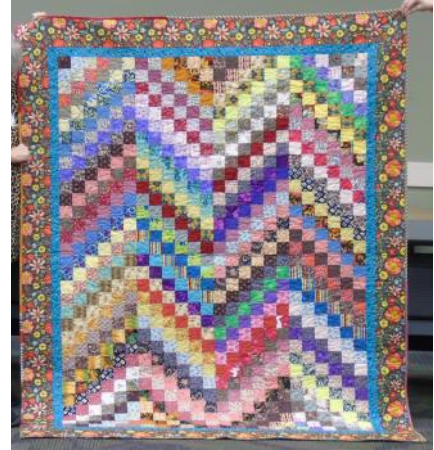
Billie Harrell, Sweetie Pie, Peaceful Garden and Scrappy Bargello