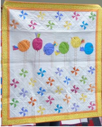
Whimsical bird and pin wheel quilt.