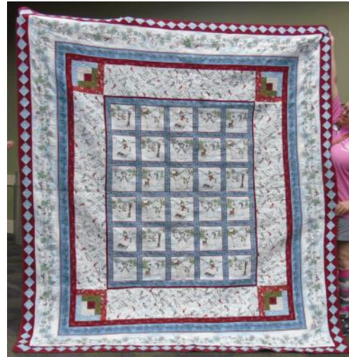
Cindy Barnett, Snow Day