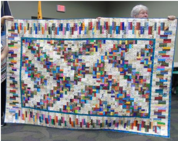
Cindy Pannier, Scrappy log cabin