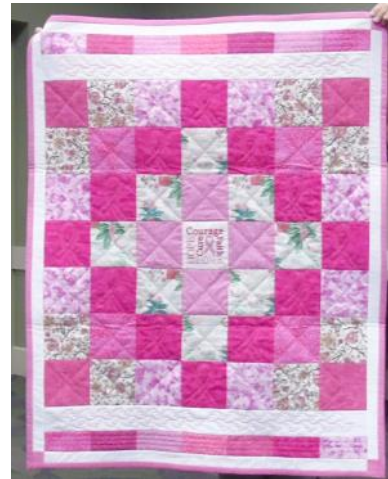
Laura Key, Breast Cancer panel