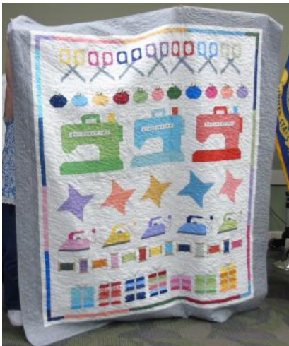
Colorful quilts from Lori Holt patterns and/or designs.