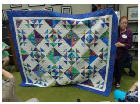
Missy Lee Oh Happy Day (Kaffe Fassett fabrics)