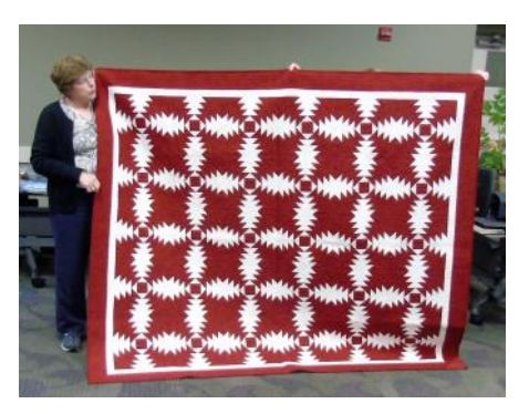
Sarah Ketchum Red Pineapple