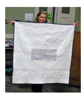
Diana Kelly Going in Circles (front and back)