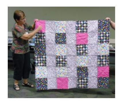
Polly Duggan with three completed Community Quilts