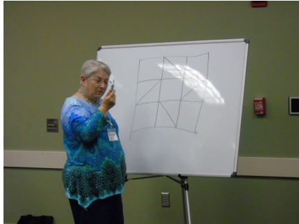
Team 5—Shoo Fly