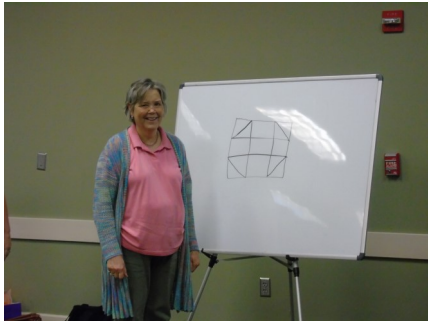
Team 4—Friendship Star