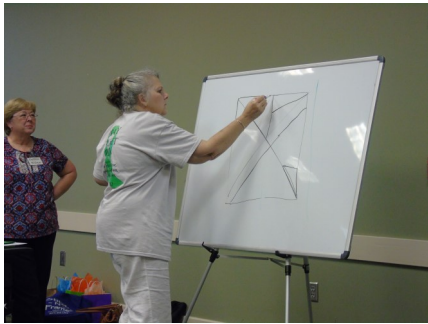
Team 1—Simple Basket