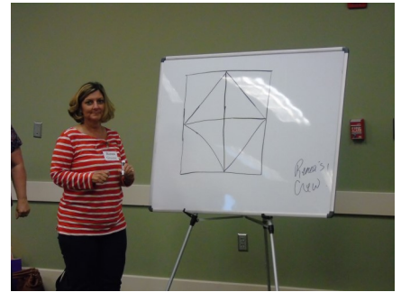
Team 3—Broken Dishes