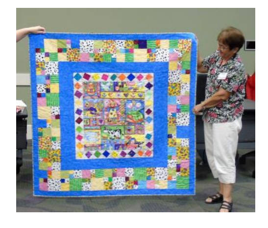
Child's panel with cute "cow" fabric