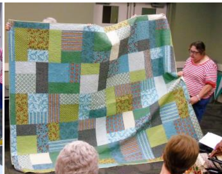
Sarah McCormick—Days of Yore/pillow cases, hot pink and turning 30