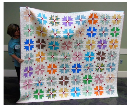
Renea Greene Cross and Crown