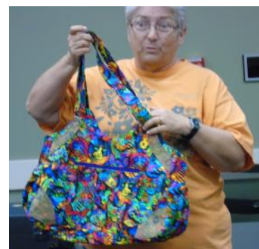
Marilyn Rose - Tote bag (cute cat fabric with leather accents)