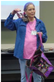
Missy - microwaveable bowls