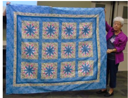
Delene Browning—MS Block (paper piecing)