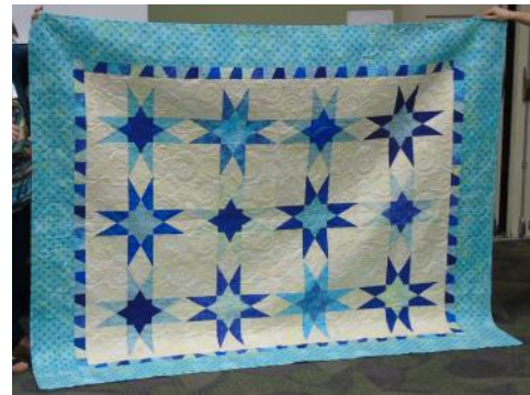
Sparkler is an individual pattern and included in either Scrap Crazy book.