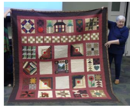
Beth Boone - Sampler quilt