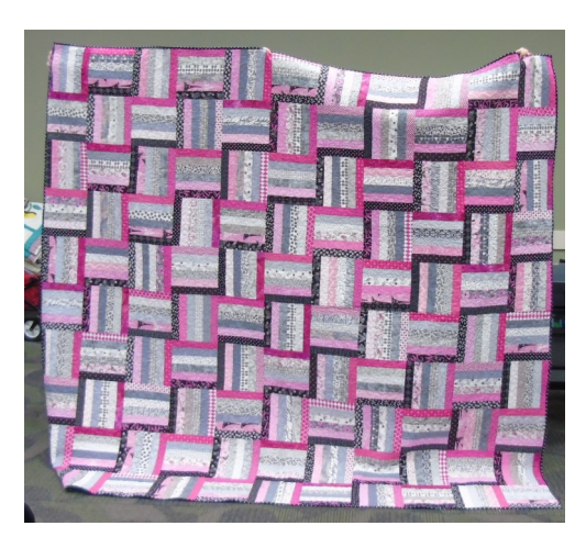
Delene Browning -Scrappy Rail Fence