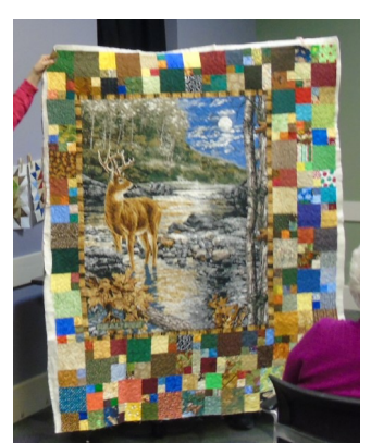
Thanks to Nita Stone for Quilting our recently completed Community Quilts.