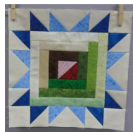
Guild members' samples of Block #5 - Log Cabin Star