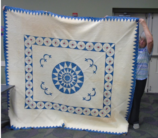
Cindy Pannier - treasured blue and cream quilt