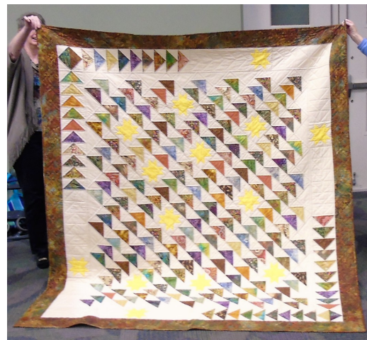
Robbie Wise - Flying Geese