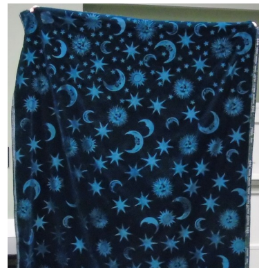
Jo Patterson - Embossed velvet