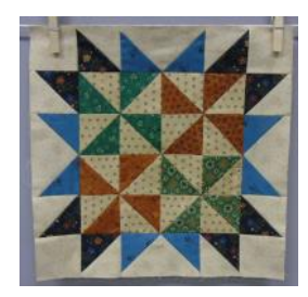
July - Pinwheel blocks by various members