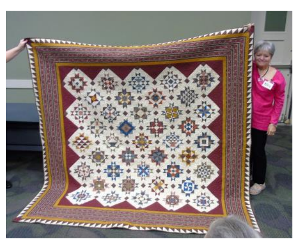
Billie Thompson—Hampton Ridge