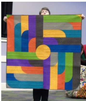
Amy Schwalm— Fan blades, modern wall hanging (front and back)